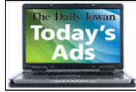
Today's Display Advertising