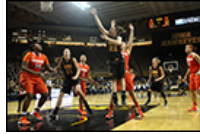
The importance of Logic