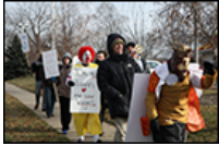
Community members protest wages